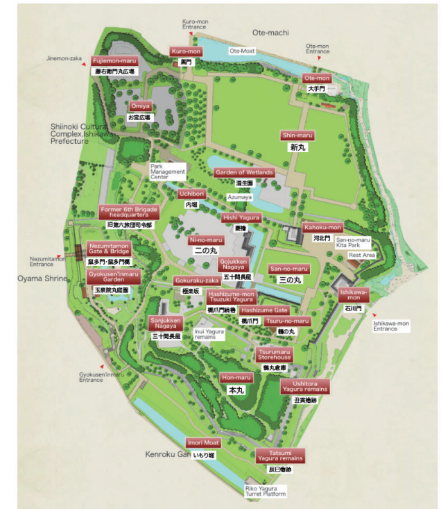
Figure 5 Map of the Kanazawa castle.