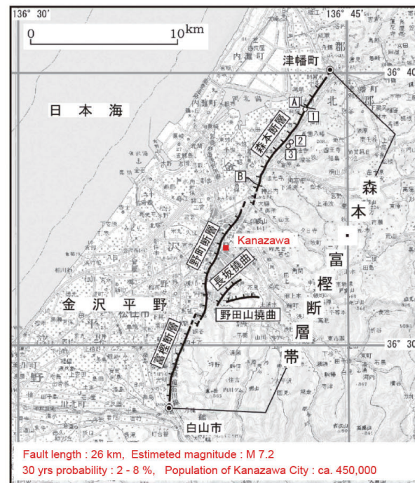
Figure 2 Map of the Morimoto-Togashi Fault Zone. (HERP, 2013)

Kanazawa is a one of the traditional cities in Japan. A major active of the Morimoto-Togashi Fault Zone runs on the northeastern side of the Kanazawa castle, which was found in the Edo era. Landform along the fault zone is not sharp scarp but gentle slope. We will go down along this gentle flexural scarp in the downtown to Omicho Market. Many foods, including fish, vegetables, have gathered here for every season. People call it as “the kitchen of Kanazawa”. After leaving Omicho Market, we will walk through a pass between the Kanazawa castle and the Oyama Jinja (Shrine). The Oyama Jinja enshrines one of a lord of Kaga domain, Toshiie Maeda, who was a excellent “samurai” and established the base of Kanazawa and Kaga domain. Our walk will end here. You can entre the Kanazawa castle if you are interested (Entrance fee is 320 JPY).