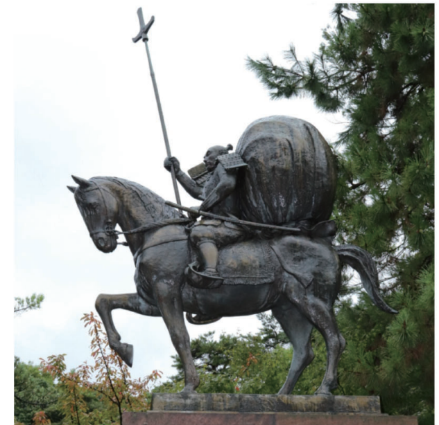
Figure 4 Statue of Lord Toshiie Maeda at the Oyama Jinja